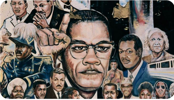
HIST 3910: Black Political Thought